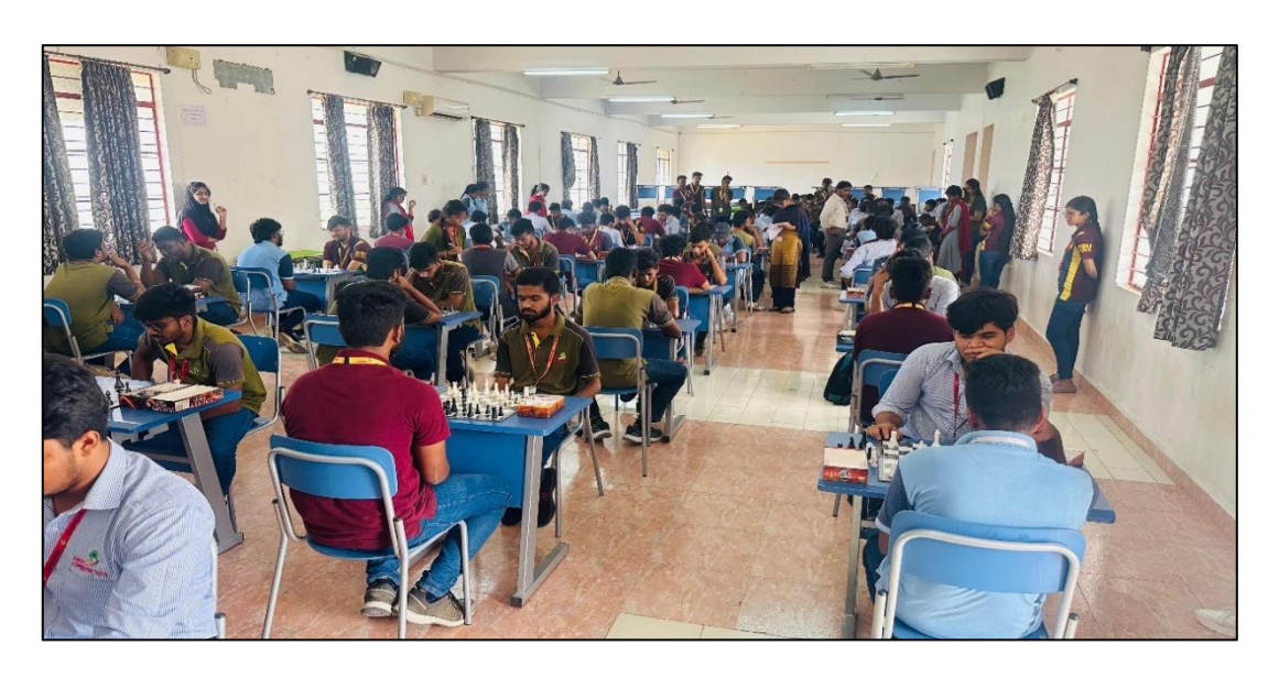
Chess competitions are organized by on the occasion of International Chess Day MBU

International Chess Day is celebrated annually on July 20th to commemorate the establishment of the International Chess Federation (FIDE) in 1924. It's a day to promote the game of chess, celebrate its cultural and educational significance, and encourage people of all ages to engage in this intellectually stimulating activity. A chess competition was organized on 31<sup>st</sup> July 2023 for students in the TGR Auditorium under the auspices of International Chess Day.