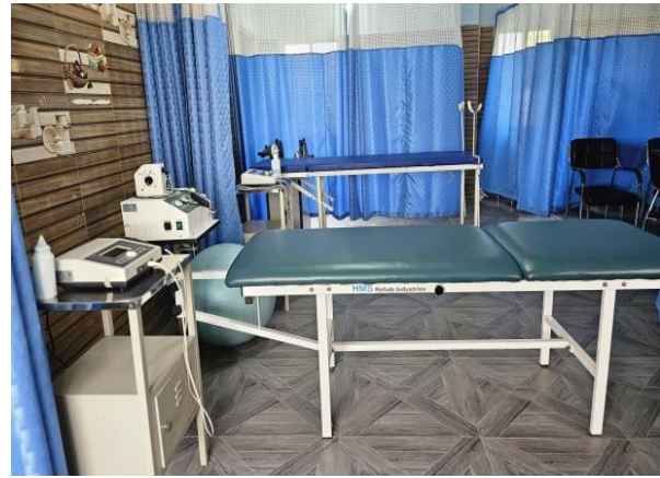
Physiotherapy Outpatient Clinic