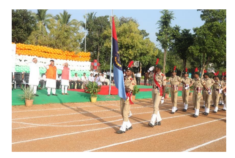
Guard of Honour by NCC cadets of MBU