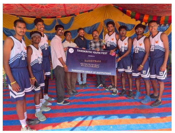
Sanskrithi Tournament Basketball Winners

13. MBU basketball and kabaddi participated in the state level sanskrithi Tournament and Stood As winner's basketball and kabaddi.