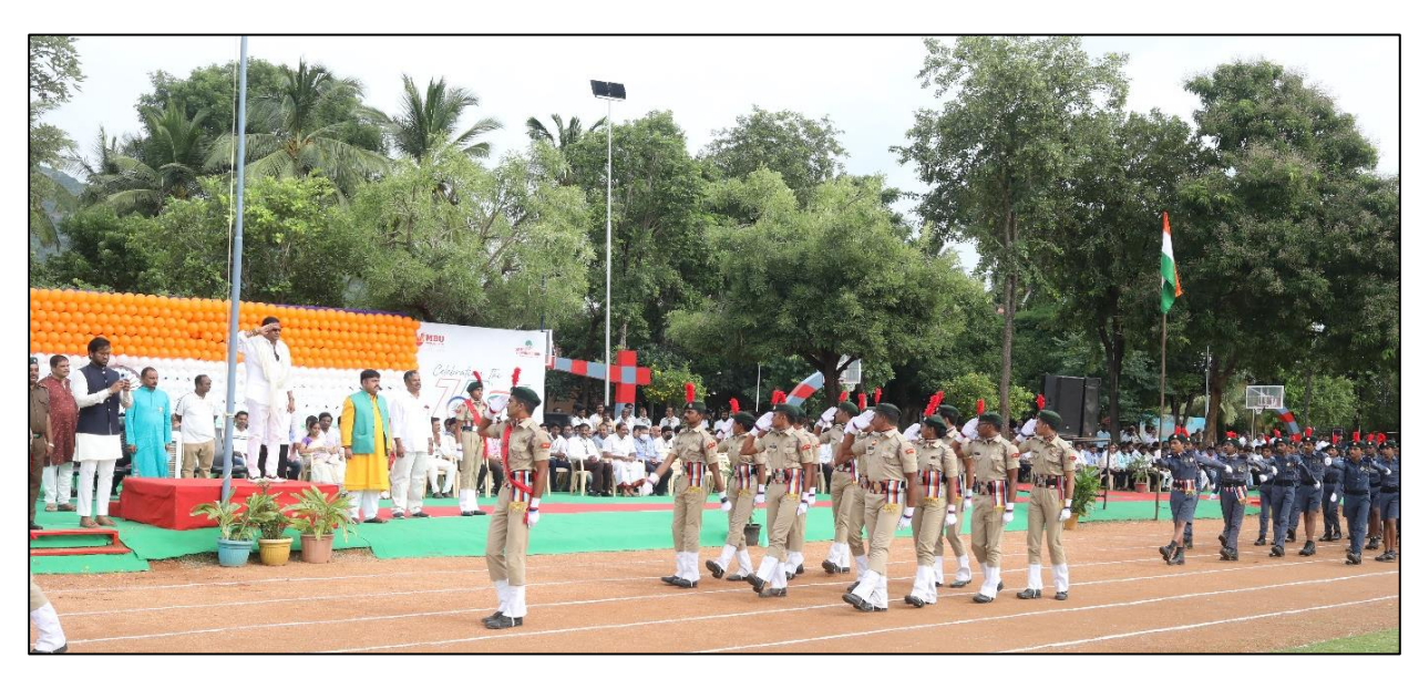
Hon'ble Chancellor, MBU Receiving Guard of Honor by NCC Cadets

Republic Day in India, celebrated on January 26th, marks the adoption of the Constitution in 1950. It honors India's democracy, culture, and achievements with state tableaux and cultural performances. The day symbolizes national pride and unity. At MBU, NCC cadets participated in a parade, and the Chancellor, Pro-Chancellor, and Vice-Chancellor received the guard of honor from the cadets.