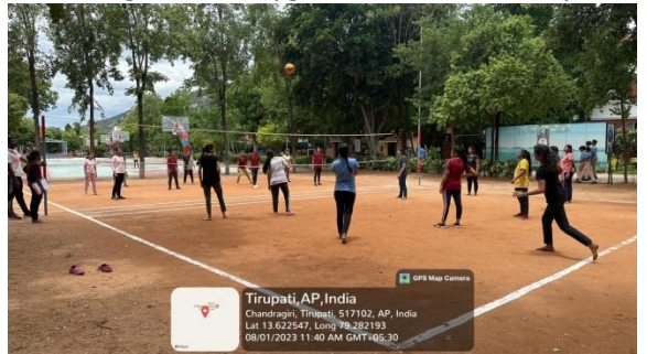
Sports meet for the students of SPAHCS held on 1st August 2023