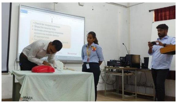
Hands on workshop for basic life support training for our students during celebration of world emergency day on 27<sup>th</sup> May 2023