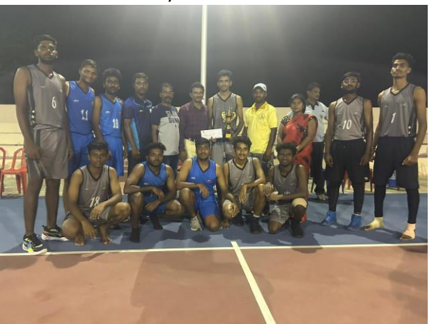
RGM basketball league Winner

1. MBU football team participated in the RGM basketball league and stood as winners in the tournament, which was held at at Nandyala.