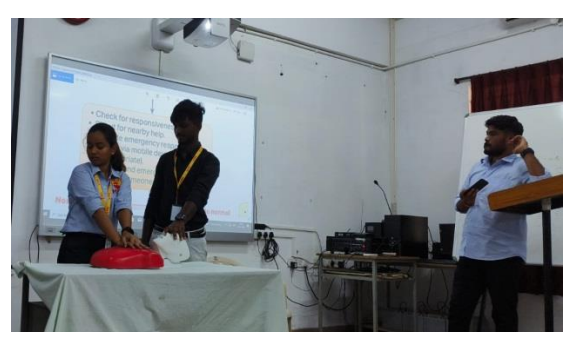
Mastering in basic life support is essential for every health care professional to support the patients in case of emergency