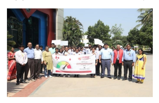
Wolrd hypertension day awareness program at MBU on 17<sup>th</sup> March 2023

School of Paramedical Allied and Health Care Sciences organised medical camps and awareness programs to the public and students of the university. These medical camps offer a platform for health education, raising awareness about hygiene, nutrition, and preventive measures for common diseases, which also helps in bringing together healthcare professionals and local residents and encourages communities to engage more with health services for a healthy community.