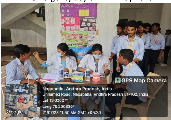
Dental camp for the students of our university to maintain good oral hygiene held on 21st July 2023