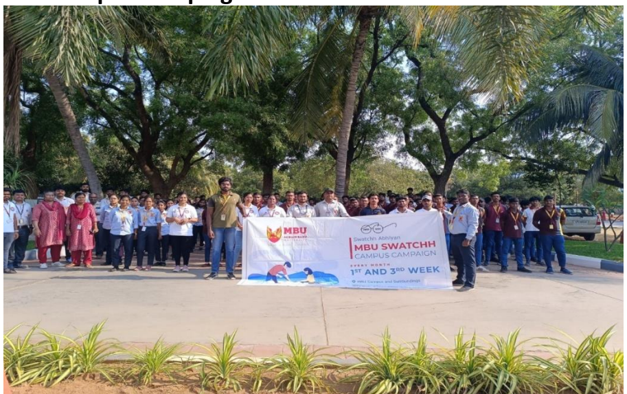
Cleanliness Pledge performed by faculty, students, and volunteers before beginning the MBU Swatchh campus clean program.