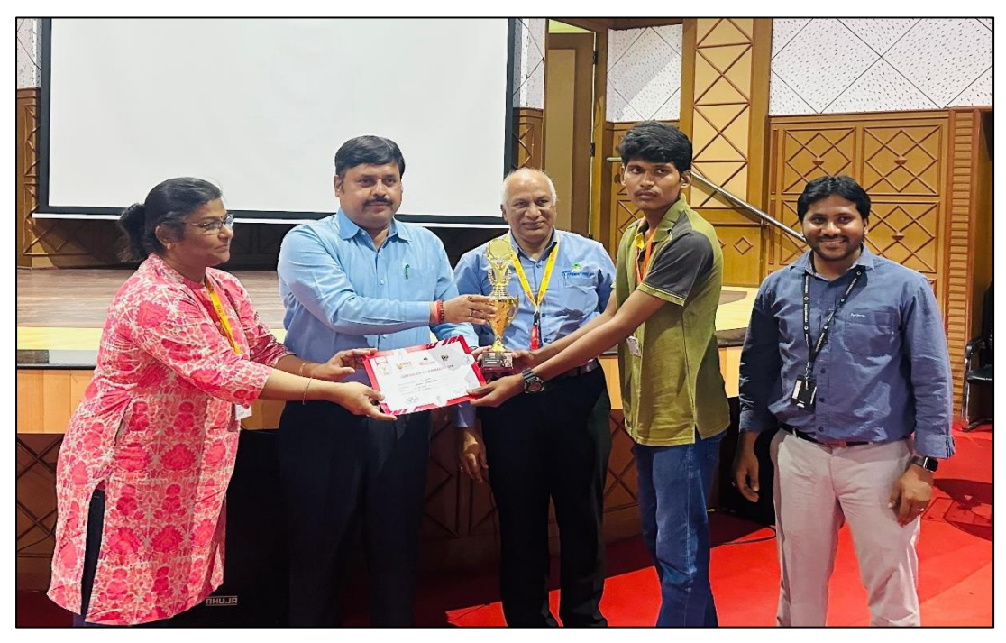
Prize Distribution to the Winner