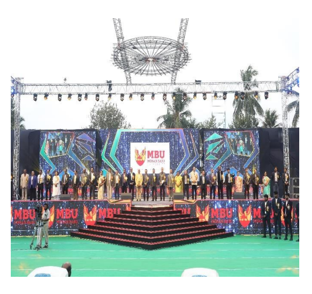
Leadership Team of MBU