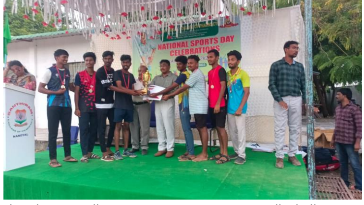
Shantharam College Invitation Tournament Volleyball Winner

2. SoPS Volleyball team participated in the shantharam college invitation tournament and stood as winners which was held at Nandyala