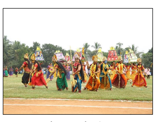
Performance of students