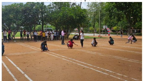
Regular exercises and sports events keeps our students healthy and fit