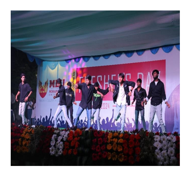
Cultural program by students in Freshers Day