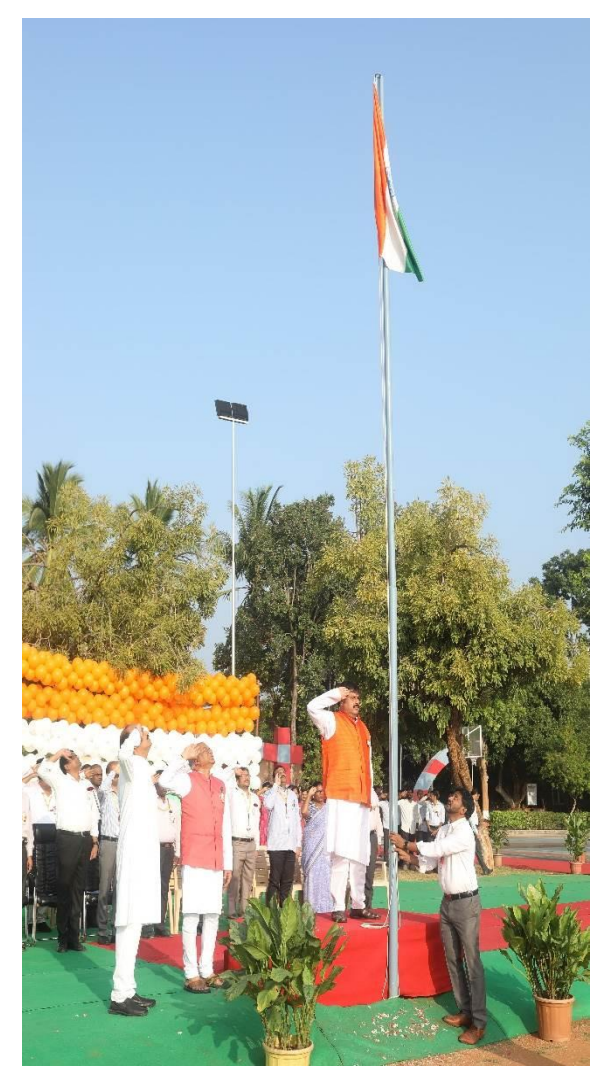
Flag Hoisting by Vice-chancellor

India's Independence Day, celebrated on August 15th, marks the nation's freedom from British rule in 1947. It's a day of patriotic fervor with cultural programs and flag-hoisting ceremonies nationwide. The occasion symbolizes India's unity, diversity, and ongoing journey towards democracy and prosperity