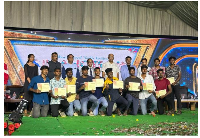
Vignan University Tournament Volley Ball Runners

10. MBU Volleyball team participated in the national level Vignan University Tournament and Stood As 3^{rd} place in the volleyball and 4*100 gold medal and 100 mts 2nd place and long jump 2^{nd} place