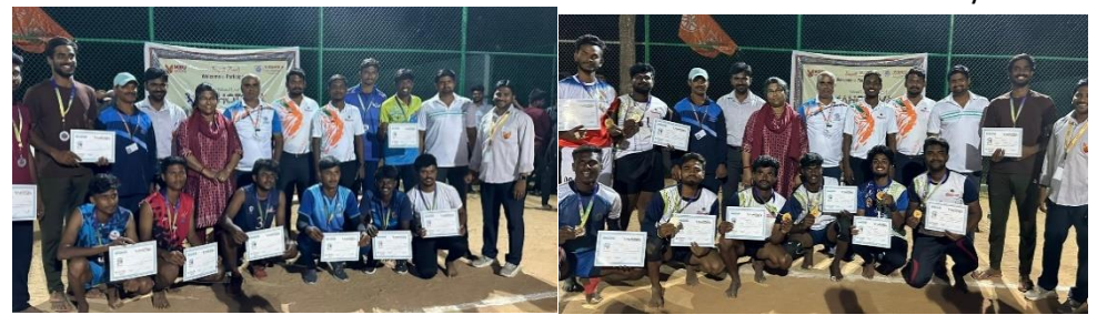
Vignan University zonal level Kabaddi Winner and Volley ball Runners

9. Our MBU Volleyball team and kabaddi team participated in the national level vignan University zonal level Tournament and Stood winner in kabaddi and runner in volleyball