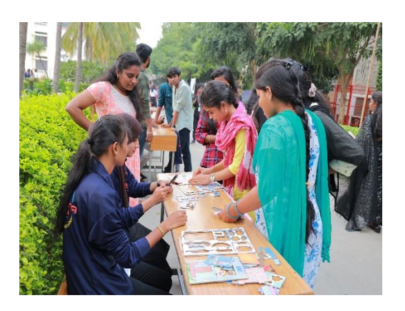
Students Participating in Spot Events