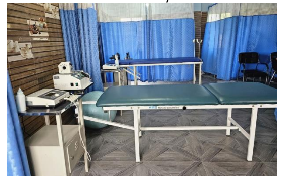
Physiotherapy outpatient clinic at MBU