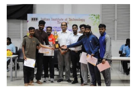
IIT Tirupati Basketball, Volleyball And Badminton Winners

7. MBU Volleyball team participated in the vignan Ap and Ts Inter University Tournament And Stood As Winners