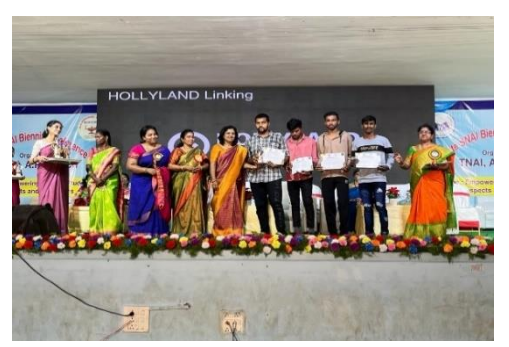
NURSES Invitation Tournament Bronze In Athletics And Badminton Runners

6. MBU Basketball, Volleyball, Badminton teams participated in state level sanyog invitation (IIT Tirupati) tournament and stood as winners which was held at Tirupati