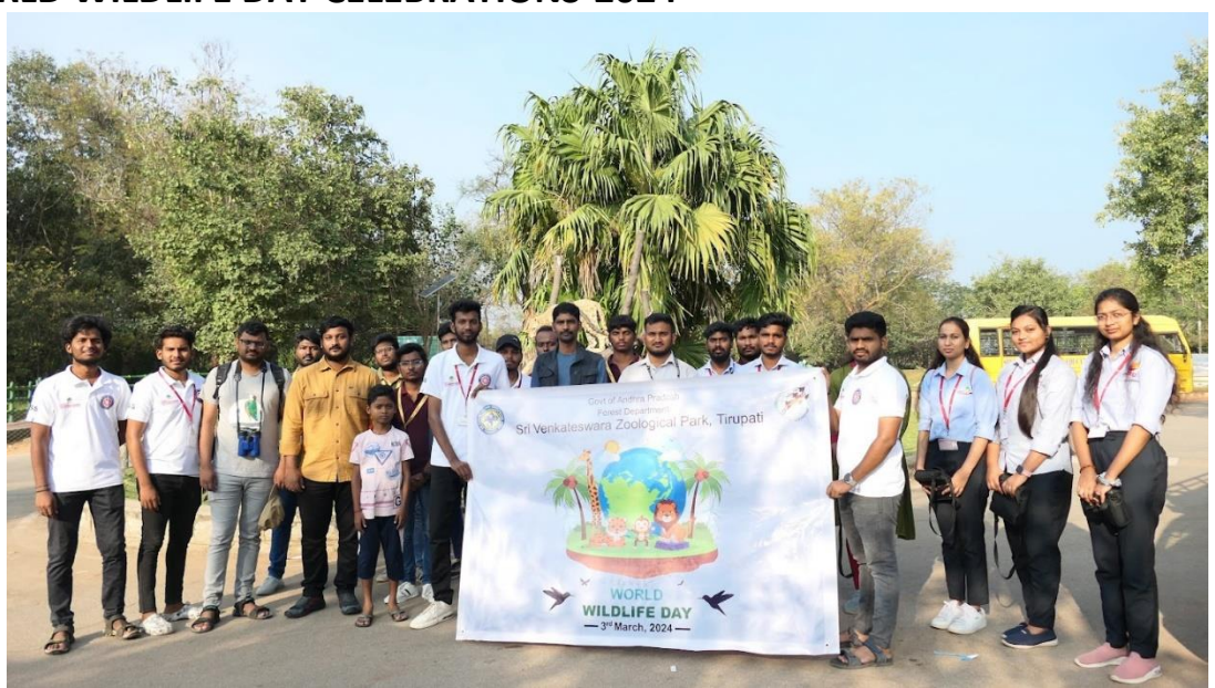
SV Zoological Park celebrated the world wildlife day celebration on 03<sup>rd</sup> March 2024 with the theme of Bird Watch and Snake Rescue, Conservation and Snakebite Mitigation workshop.