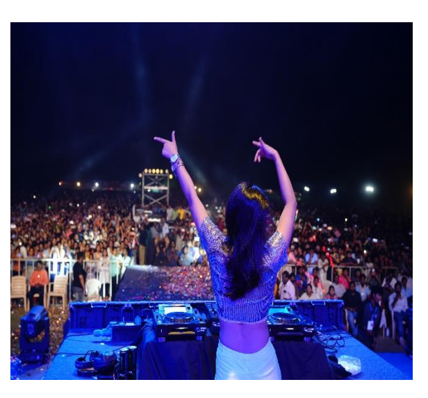
Performance by DJ Paroma