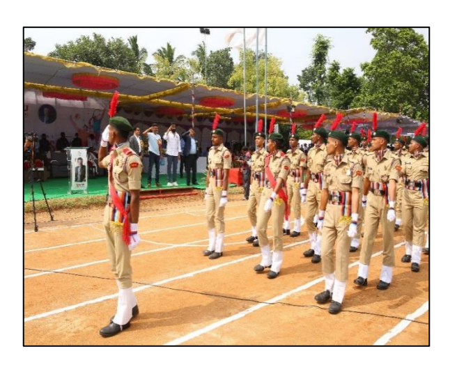
Parade by NCC cadets of MBU