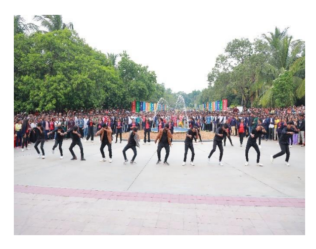
Flash mob during Mohanamantra-2023