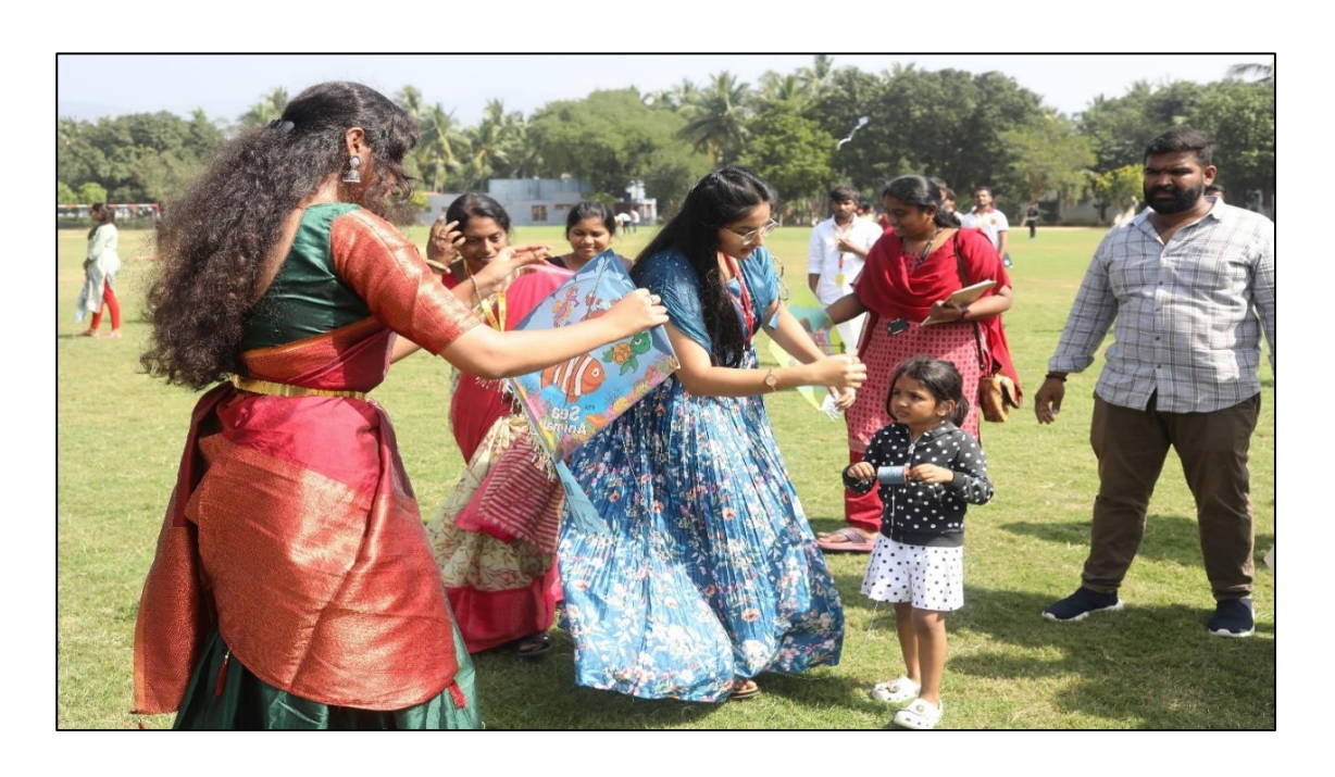
Students participating in the Kite Festival organized at MBU.