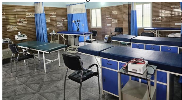
Physiotherapy outpatient clinic at MBU