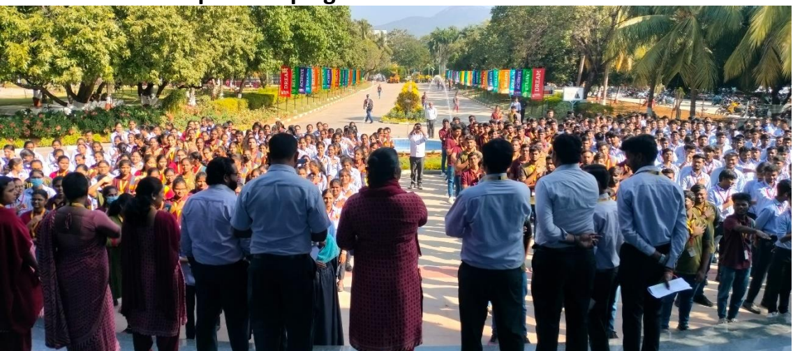
Cleanliness Pledge performed by faculty, students, and volunteers before beginning the MBU Swatchh campus clean program.