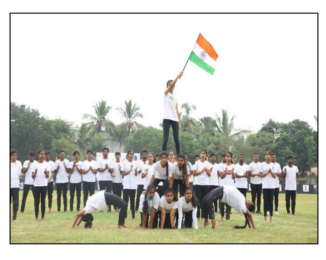
Pyramid display with national flag