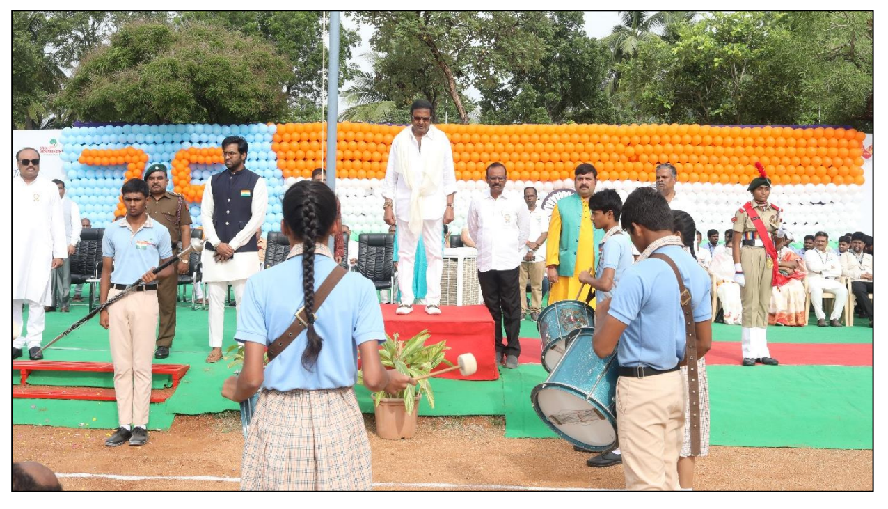
Hon'ble Chancellor, Pro Chancellor, Vice Chancellor, MBU Receiving Guard of School Band