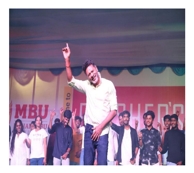
Chief guest encouraging students by his dance performance in Freshers Day