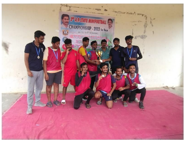
AP State Mini Football Tournament Winner

4. MBU Football team participated in the AP state mini football tournament and stood as runners in the tournament which was held at Madanapalli