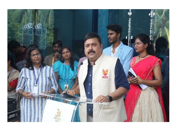
Vice Chancellor Addressing the Gathering