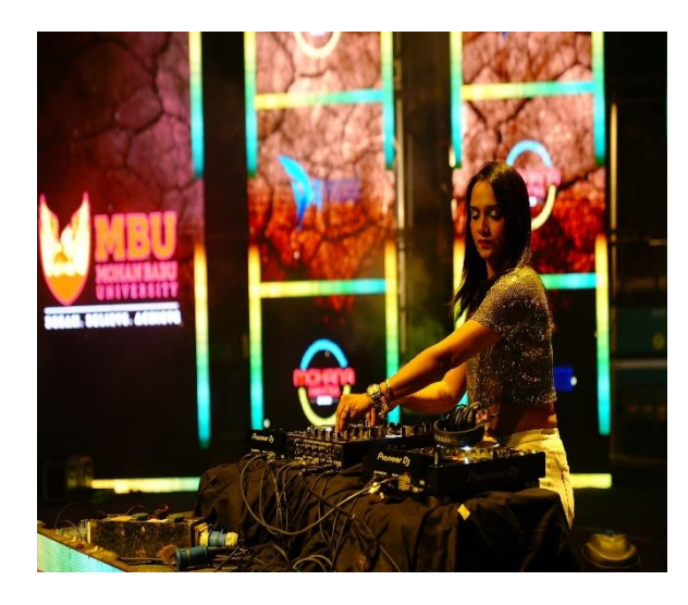
Performance by DJ Paroma