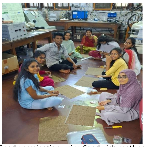
Seed germination using Sandwich method