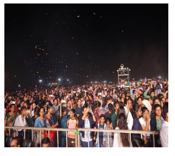
Students enjoying the DJ show