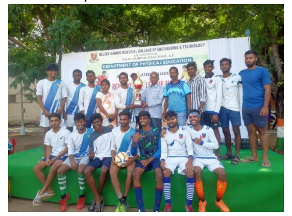
RGM Football League Winners

8. MBU Football team participated in the RGM football league and stood as winners in tournament, which was held in Nandyala.